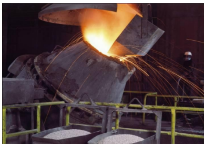
Ladle refining during conventional steel making process